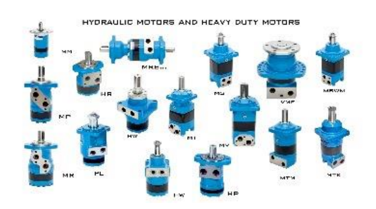
Caption 5: Range of Hydraulic Motors and Heavy Duty Motors of M+S Hydraulic.