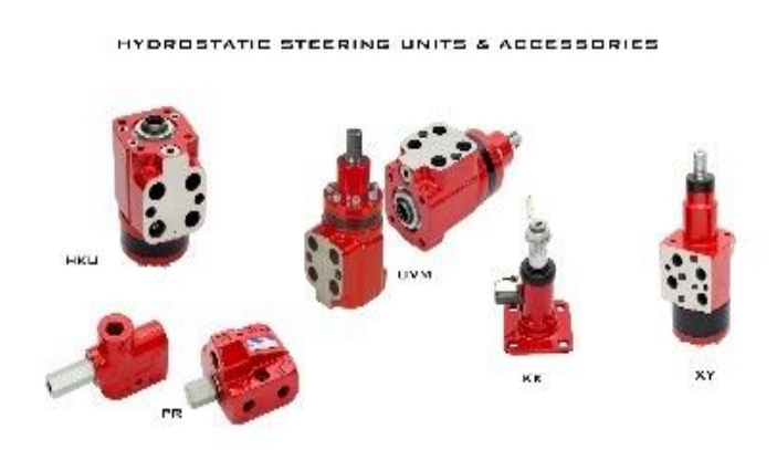
Caption 4: Range of Hydrostatic Steering Units and Accessories of M+S Hydraulic.