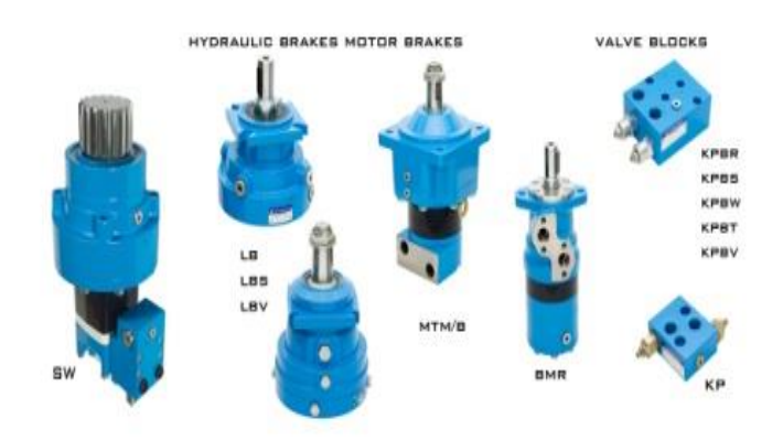
Caption 6: Range of Hydraulic Brakes, Motor Brakes and Valve Blocks of M+S Hydraulic.