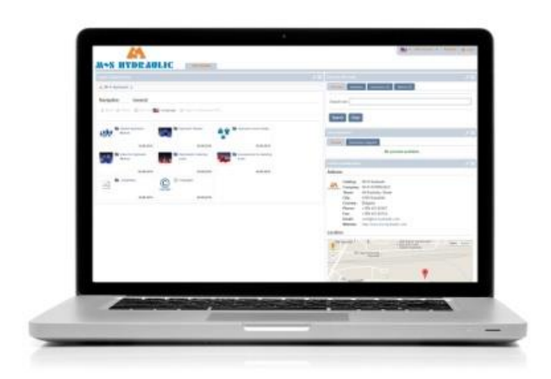
Caption 3: Since September 2015 all components of M + S Hydraulic are available at the 3D CAD models downloadportal PARTcommunity: https://ms-hydraulic.partcommunity.com