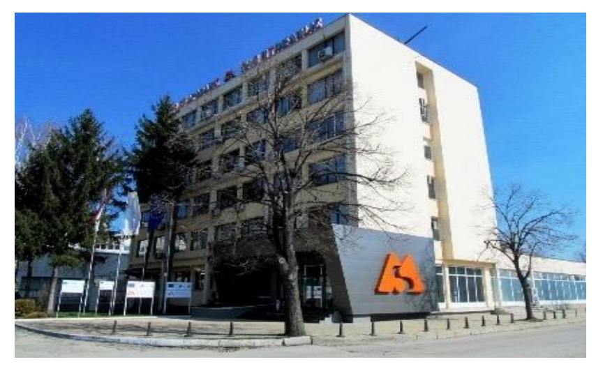
Caption 1: M+S Hydraulic PLC in Bulgaria is a globally leading manufacturer of hydraulic orbital motors etc.